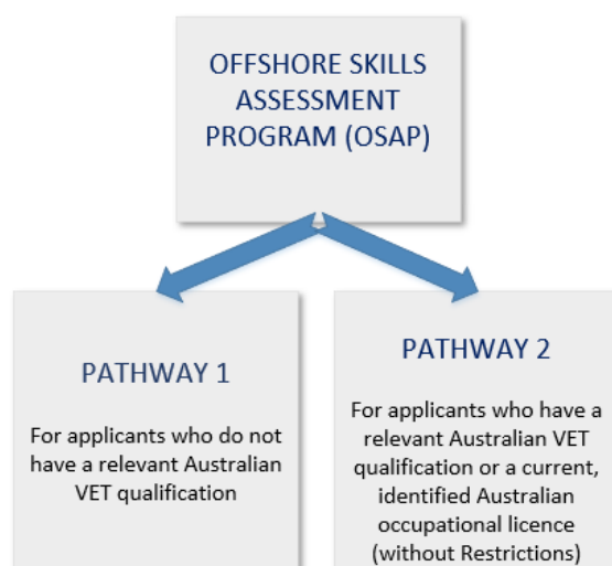
Diagram 1: Provides an overview of the alternative OSAP Pathways

A skills assessment through OSAP is for people who are applying for a skilled migration visa to Australia (excluding 485 or TSS visas), who work in a nominated occupation, and hold a passport from a nominated country or Special Administrative Region (SAR). Diagram 1 below provides an overview of the alternative OSAP Pathways.